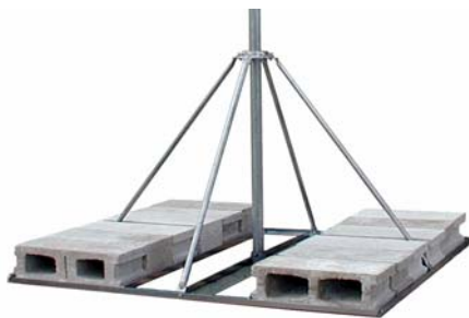
1/4-20 x 1/2" HEX HD BOLT